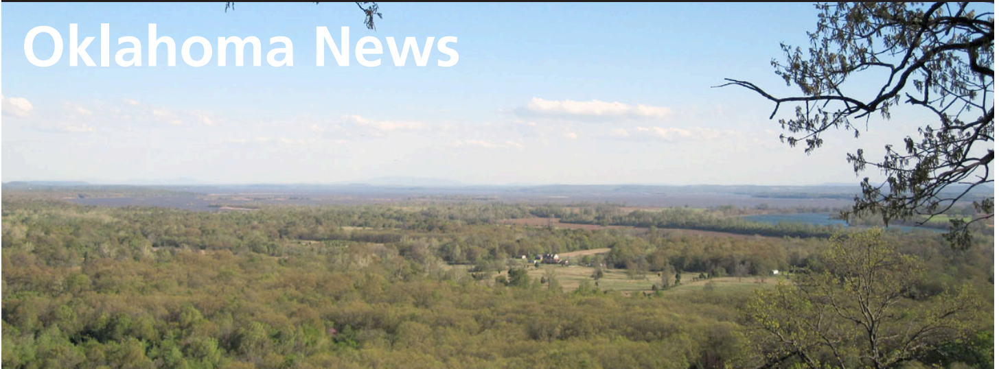
View near Vian, OK