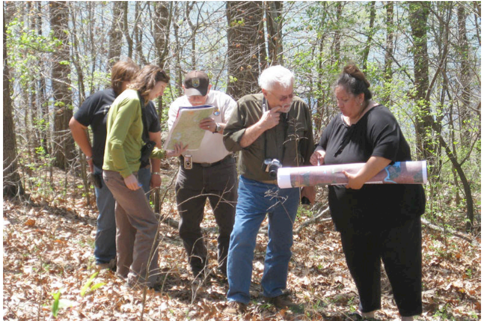
Greenway of the Cherokee Ozarks Planning Group exploring options in the field - in Dählonegah Park, Adair County, OK