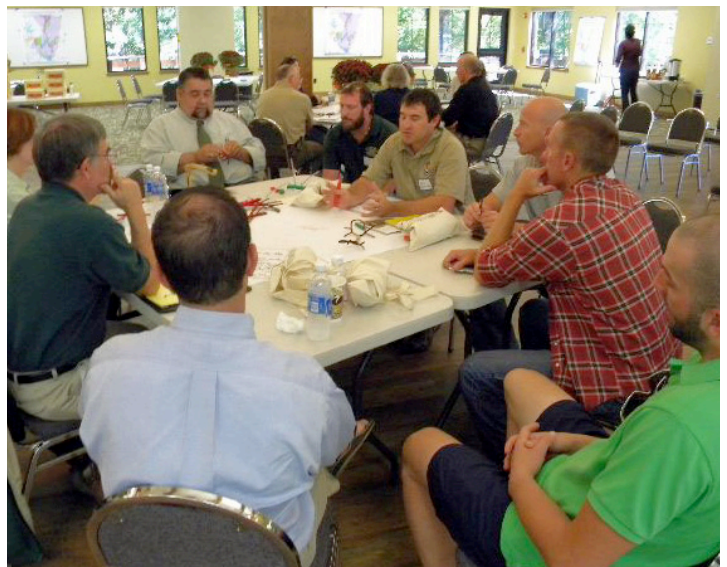
Community members discuss greenway concepts

Greenway partners have been working to craft their vision for what the greenway should be and to define what it means to be a part of the Greenway of the Cherokee Ozarks. Representatives from local non-profit organizations, municipalities, the Cherokee Nation, state and federal land management agencies, local governments as well as community members are exploring possibilities for a greenway collaboration that will enhance habitat, protect natural resources, create close-to-home recreational opportunities, and interpret and protect natural, cultural and historic resources.